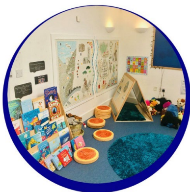
The quiet room

We also work closely with our other MAT nurseries at Woolacombe, Bampton, Clinton, Dolton and Clawton to share expertise and good practice.