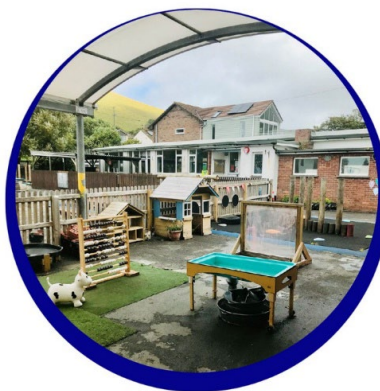
Our outside classroom

Combe Martin Primary School is part of the Alumnis Multi-Academy Trust. A like-minded grouping of schools that share the same purpose and aims; to raise standards and aspirations, enrich the curriculum and learning, with a commitment to collaboration and spreading good practice across the schools in North Devon and beyond.